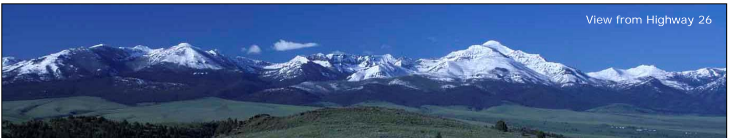
View from Highway 26