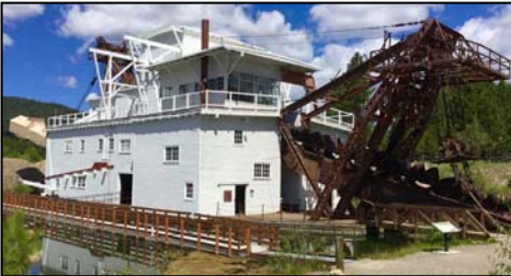
Sumpter Gold Dredge

Details of the tour are being finalized now. Be sure to send in or email your application soon to reserve your spot. We hope to see you in John Day for the Journey through Time Tour!